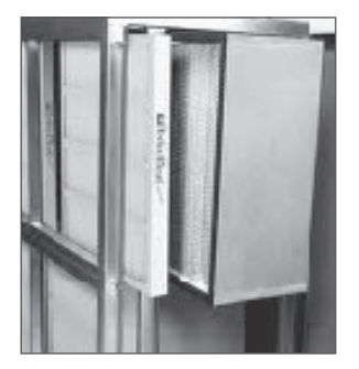
2" PerfectPleat<sup>®</sup> pleated filters are shown installed in the prefilter track on the upstream end of the housing in front of AstroCel<sup>®</sup> HCX final filters.

Gasket seal HVAC HEPA housings have a rugged, crank lock mechanism which delivers over 1,400 pounds of force on each filter cartridge. This manual mechanism is actuated from the side of the unit and permits visual observation of gasket compression as pressure is applied. Each mechanism handles up to three filters wide. The crank mechanism is removable for easy cleaning.